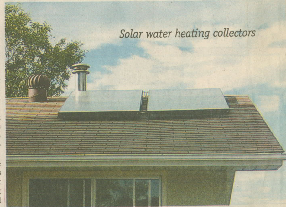
Solar water heating collectors

Weichel added that WestSource will assess the priorities based on each client's home, manage the hassle-free implementation of the plan, and provide system support and maintenance services.